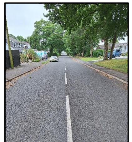
A typically straight section of the Roman Road up from the Pine Springs area of Broadstone to Springdale Road and past Corfe Hills School on towards Merley Park Road