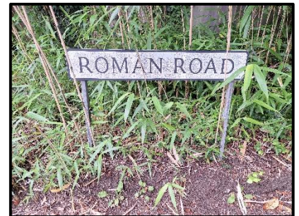
This is the signage at the junction with Clarendon Road leaving us in no doubt that this is indeed the original Roman Road

The Legion then established a temporary base to the south of the River Stour near modern day Wimborne Minster. From there, they mounted operations against Badbury Rings. They conquered the Durotrige community, and settled in a small town they built nearby which they named Vindocladia. (Close to Shapwick)