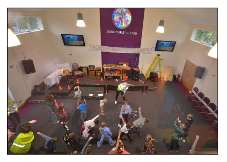
Sophie leads our workshop recruits in a warm up